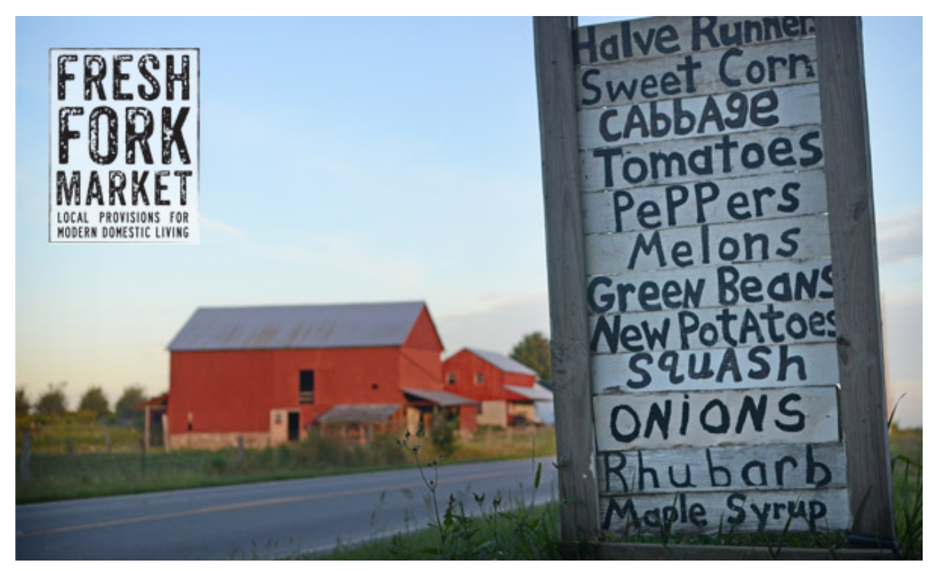
Fresh Fork Market's Summer Farm Share 2015 Summer Registration Now Open: Register Now