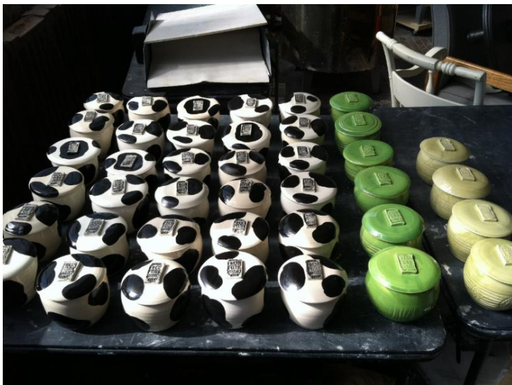
Honeypot - $25. A small canister for storing your honey. Comes complete with a lid and honey spoon/dipper.